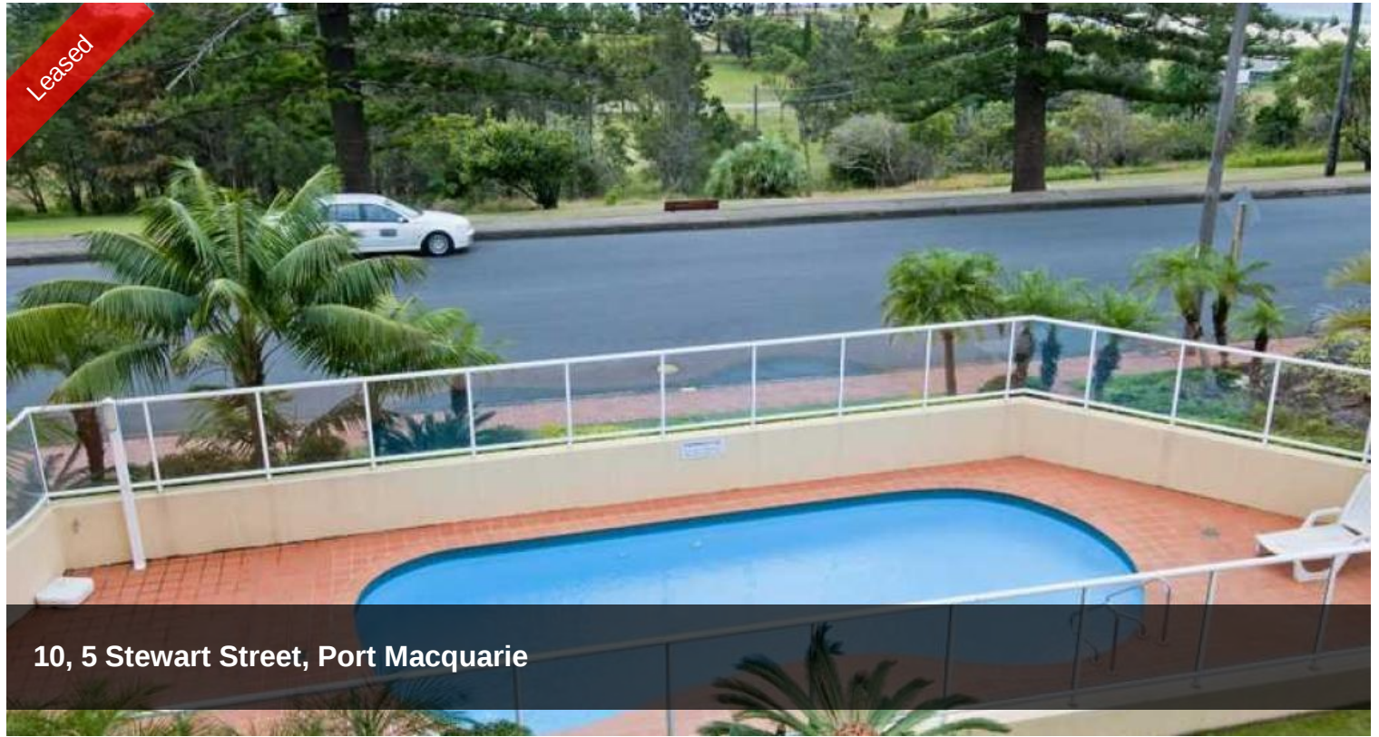
10, 5 Stewart Street, Port Macquarie