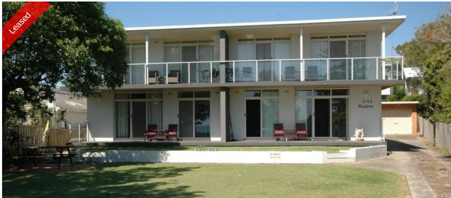
2, 12 Bundella Avenue, Lake Cathie