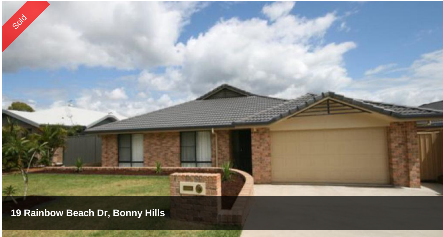
19 Rainbow Beach Dr, Bonny Hills