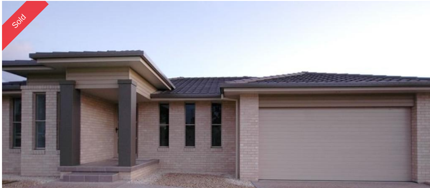
20 Kyla Crescent, Port Macquarie