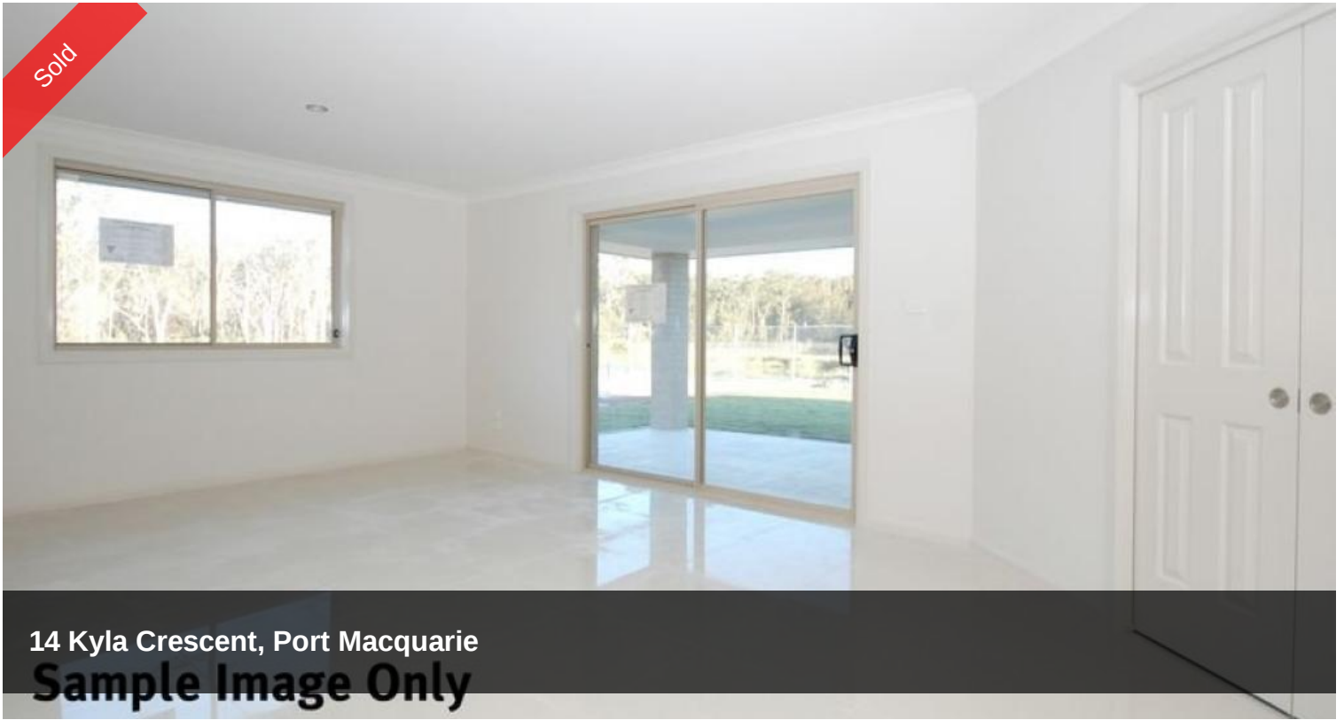
14 Kyla Crescent, Port Macquarie Sample Image Only