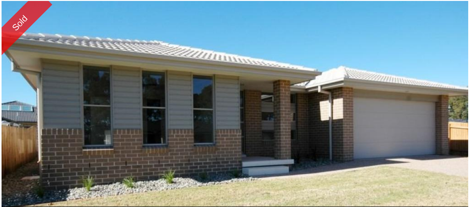
65 Currawong Drive, Port Macquarie