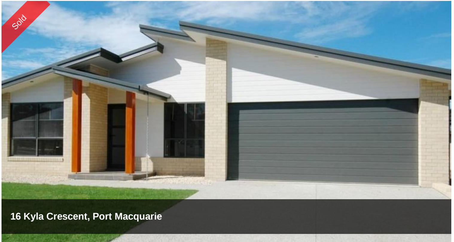
16 Kyla Crescent, Port Macquarie