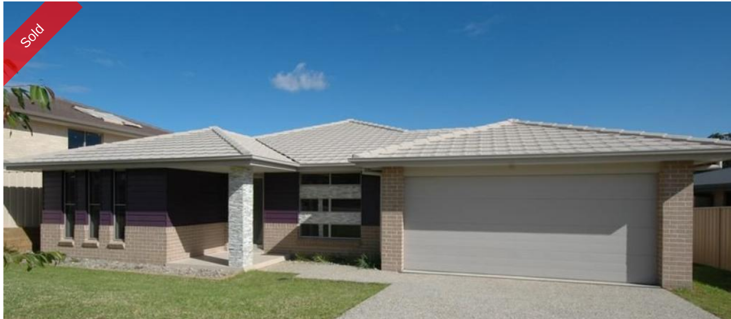
18 Kyla Crescent, Port Macquarie