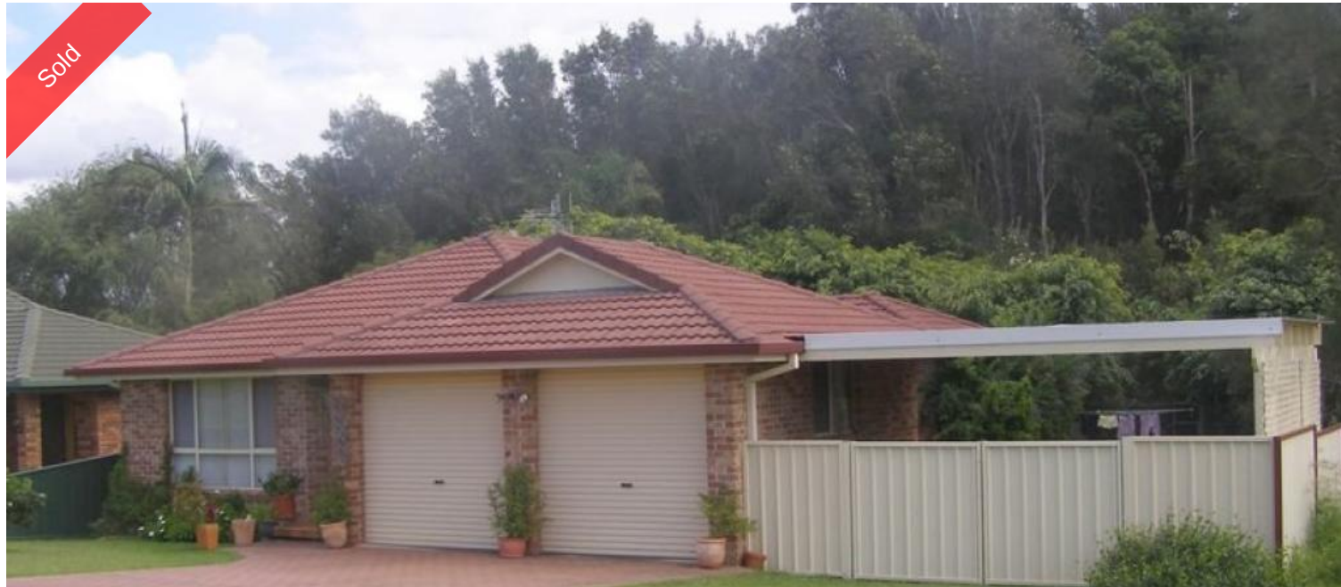
83 Fiona Crescent, Lake Cathie