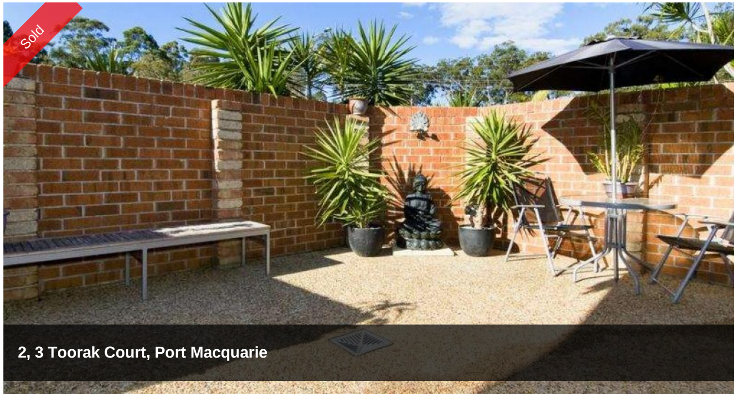
2, 3 Toorak Court, Port Macquarie