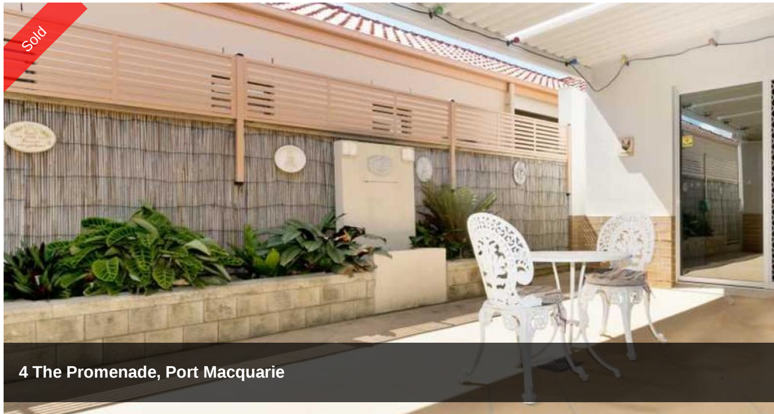
4 The Promenade, Port Macquarie