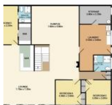
Hooker 13 Farrer Parade Port Macquarie