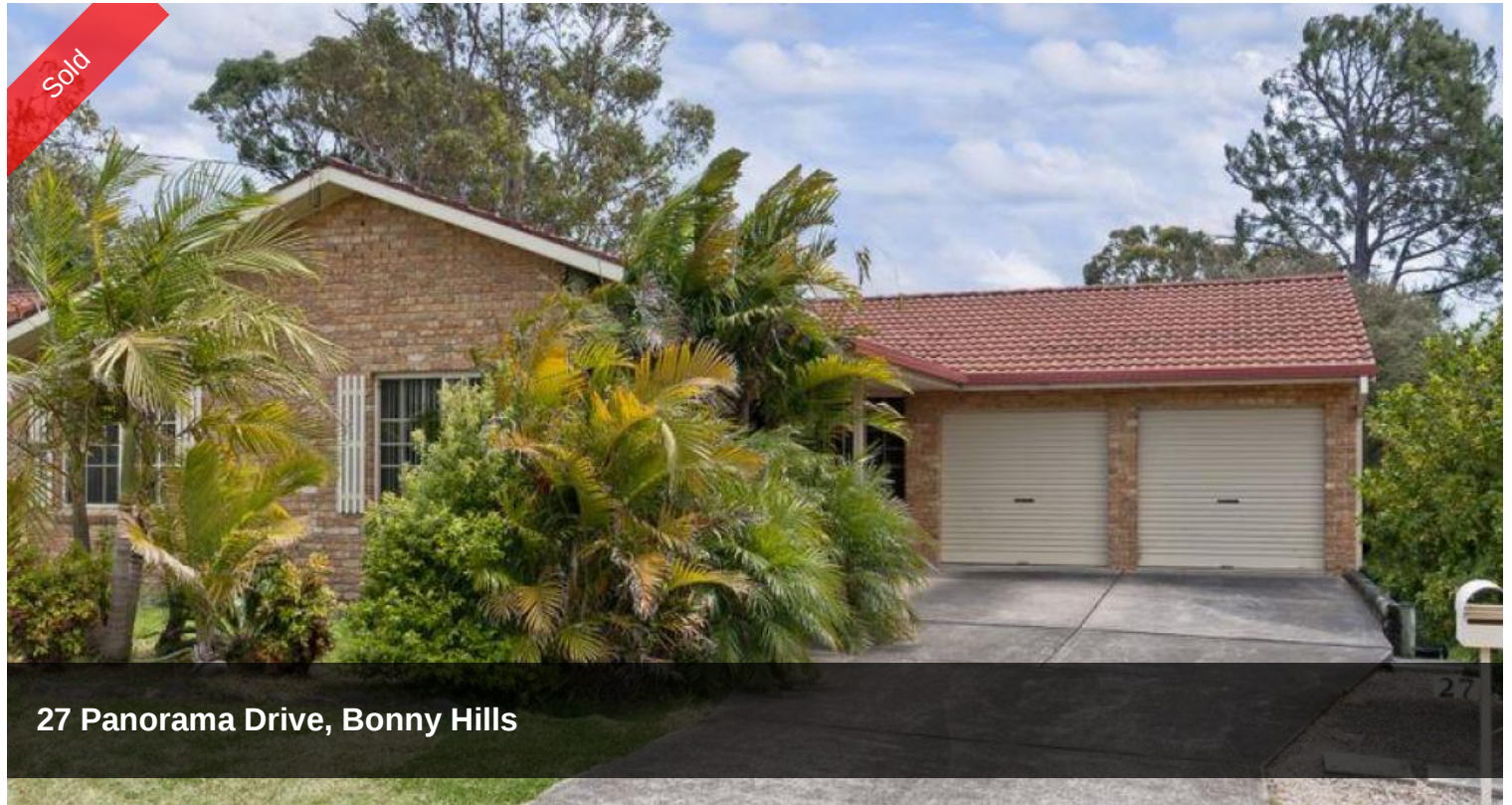
27 Panorama Drive, Bonny Hills