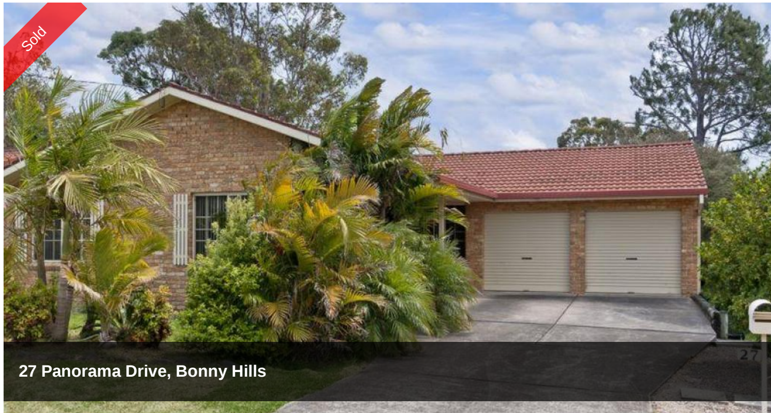
27 Panorama Drive, Bonny Hills