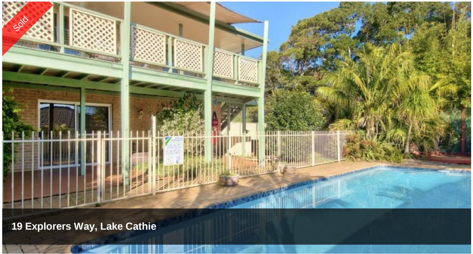
19 Explorers Way, Lake Cathie