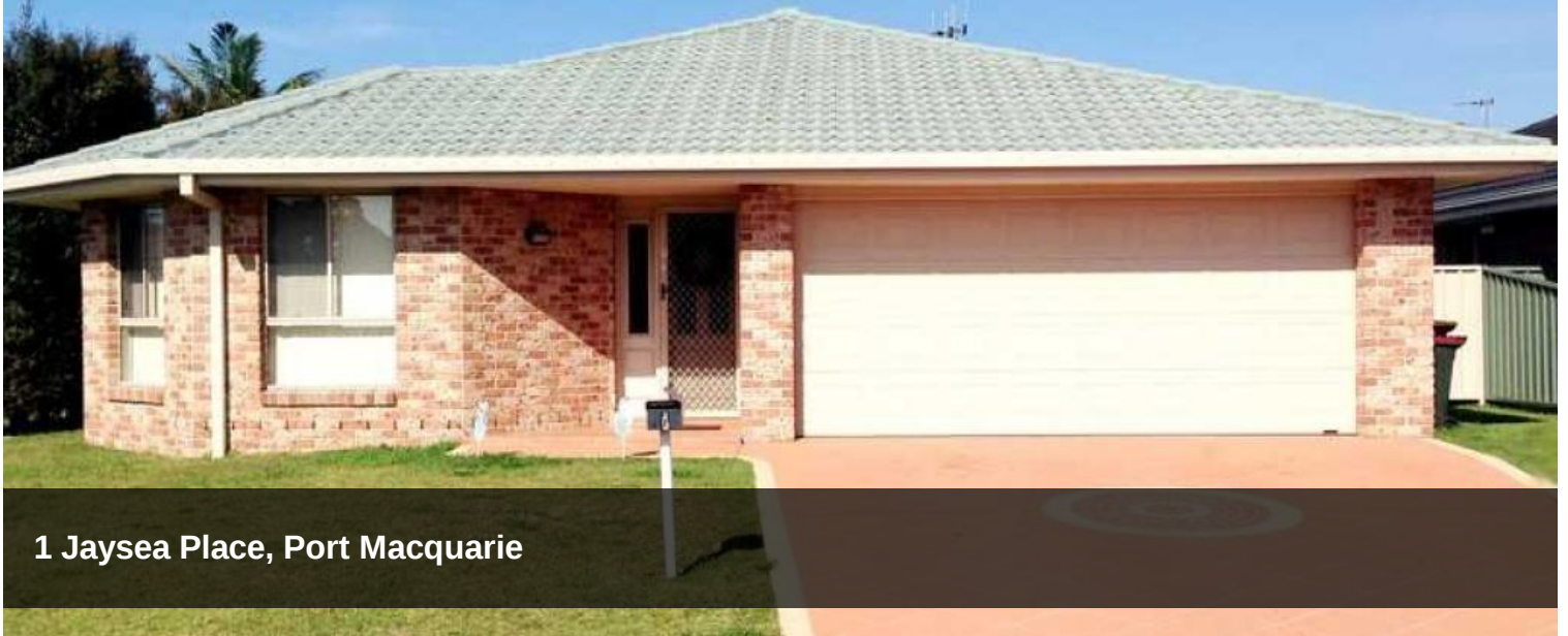
1 Jaysea Place, Port Macquarie