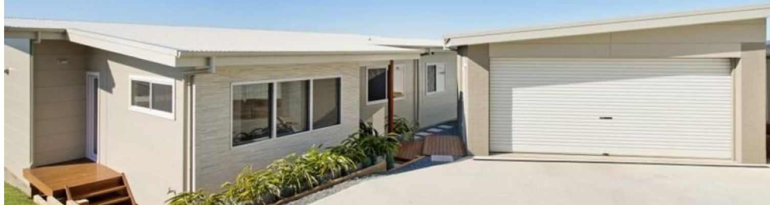
14 St Lucia Place, Bonny Hills