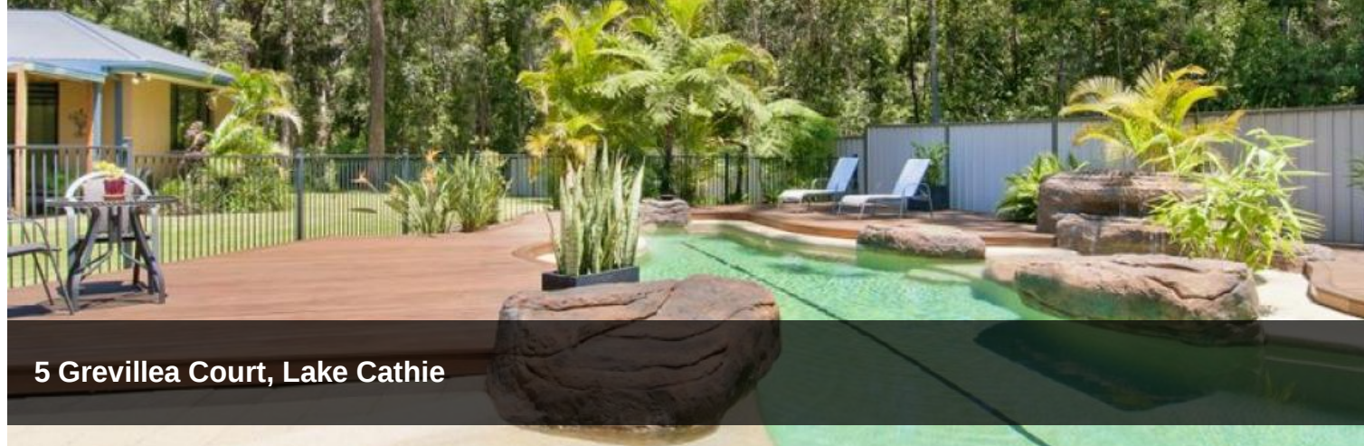
5 Grevillea Court, Lake Cathie