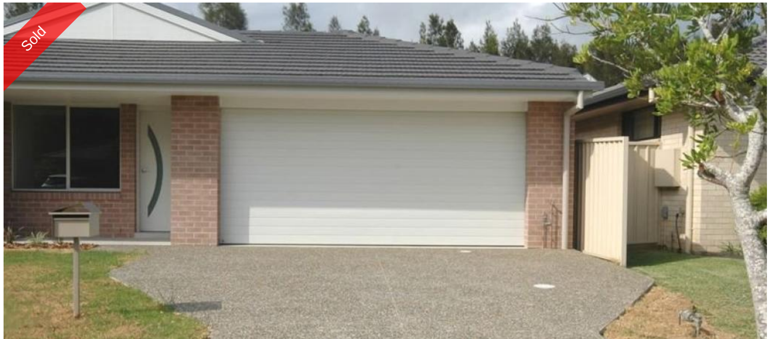
3B Buchan Place, Lake Cathie