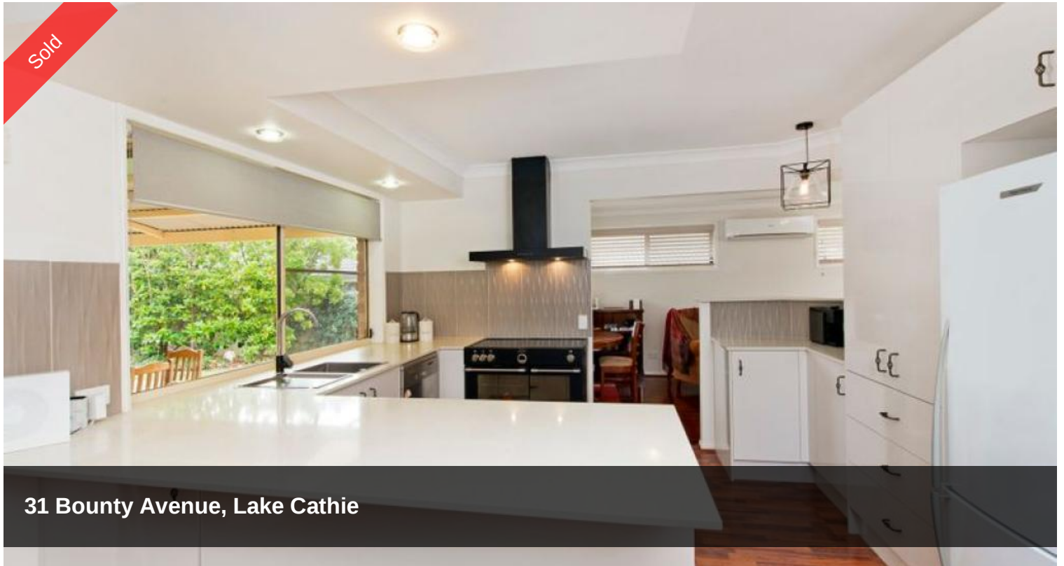
31 Bounty Avenue, Lake Cathie