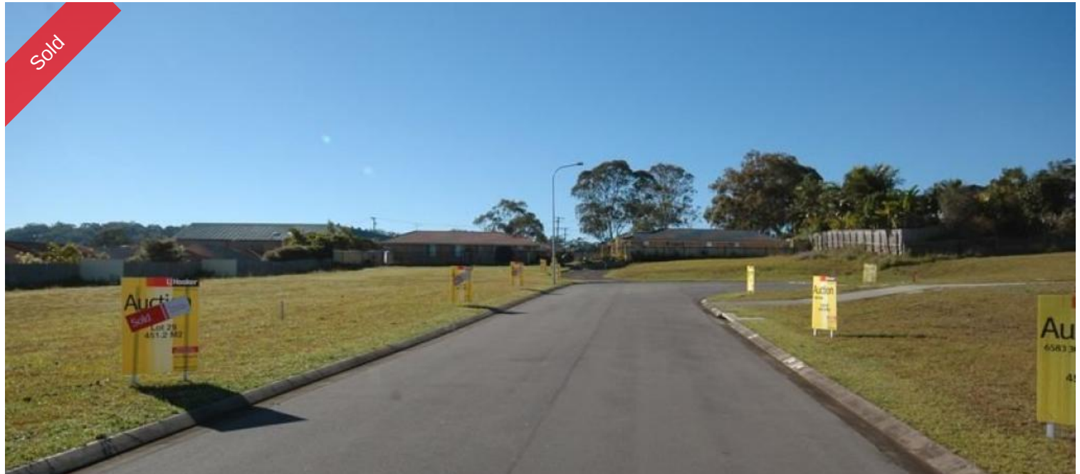
Lot , Lot 29 Friar Close, Port Macquarie