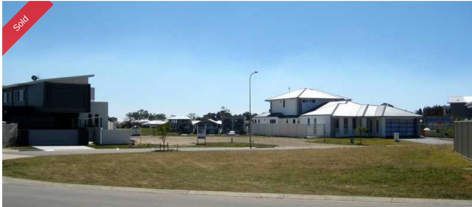
Lot , 16 Harbourside Crescent, Port Macquarie