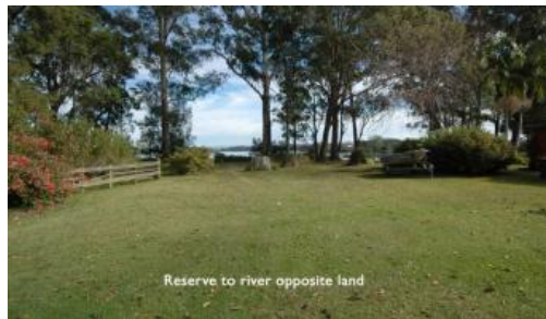
Reserve to river opposite land