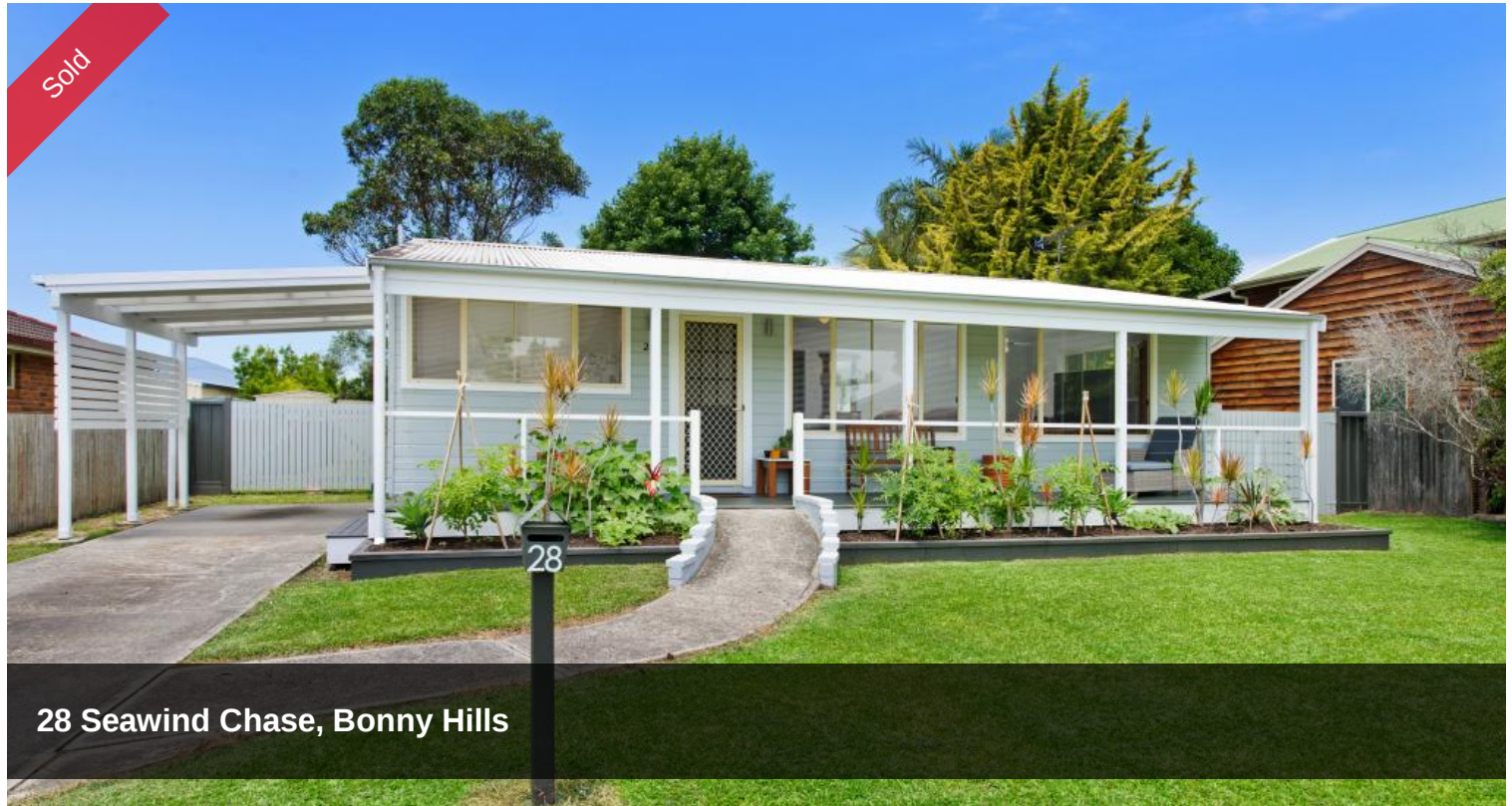
28 Seawind Chase, Bonny Hills