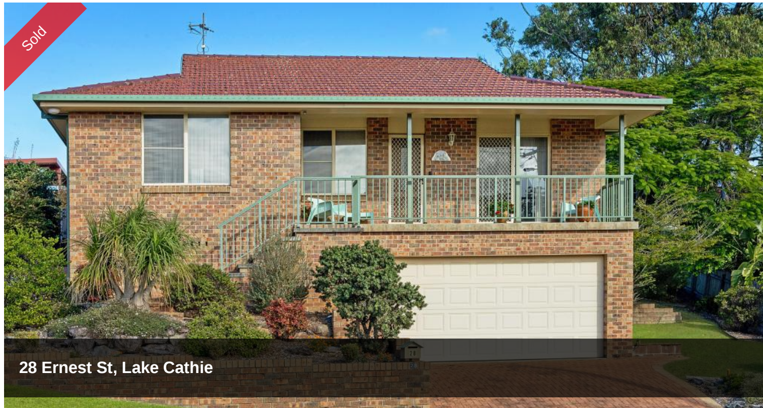
28 Ernest St, Lake Cathie