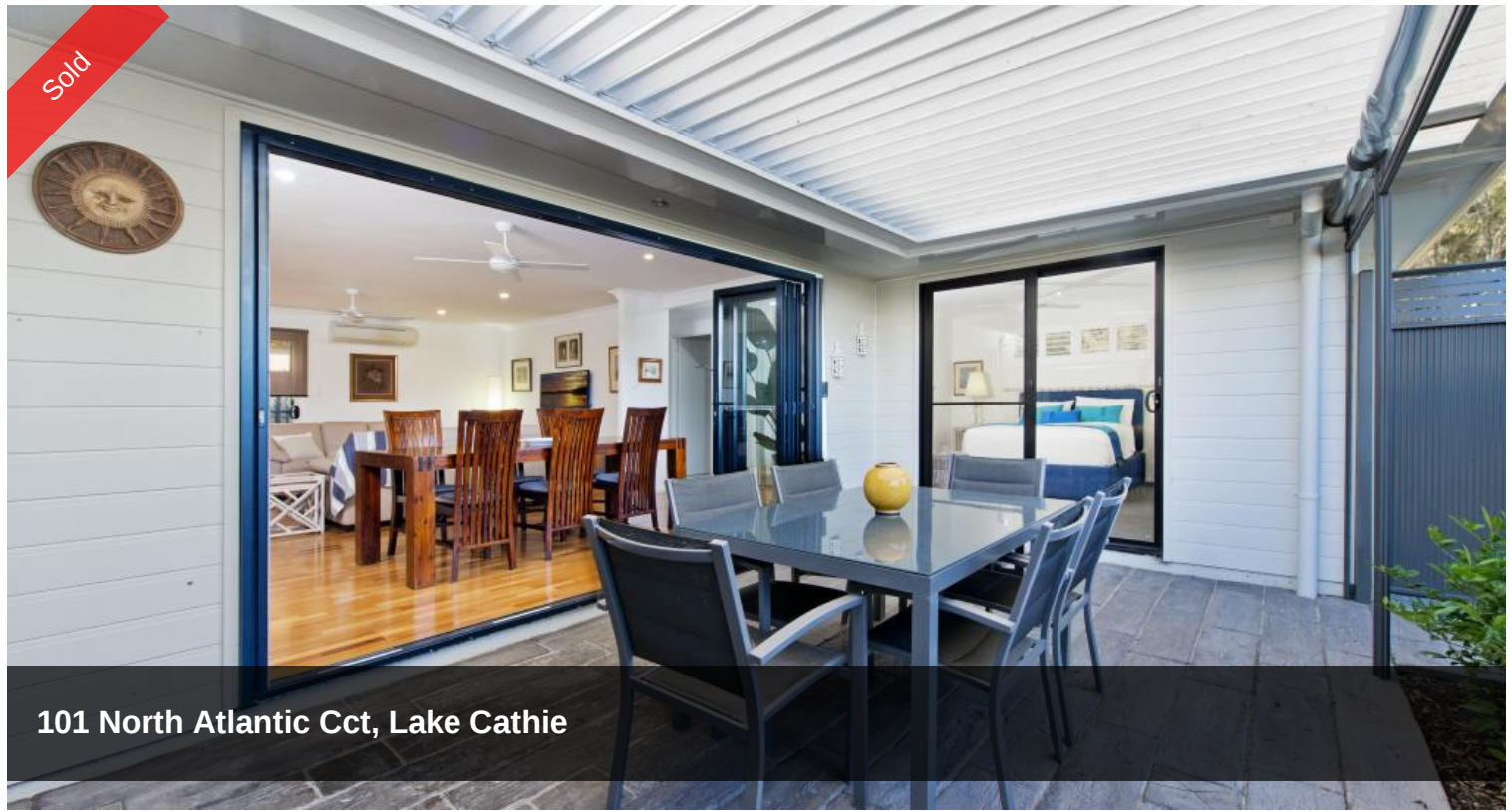
101 North Atlantic Cct, Lake Cathie