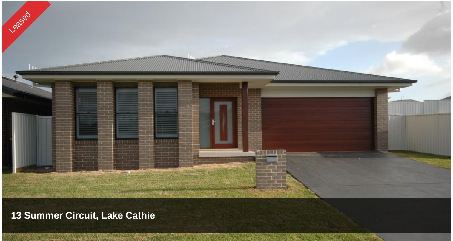
13 Summer Circuit, Lake Cathie