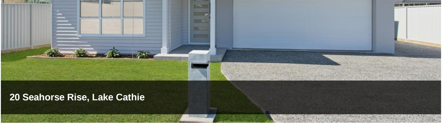
20 Seahorse Rise, Lake Cathie