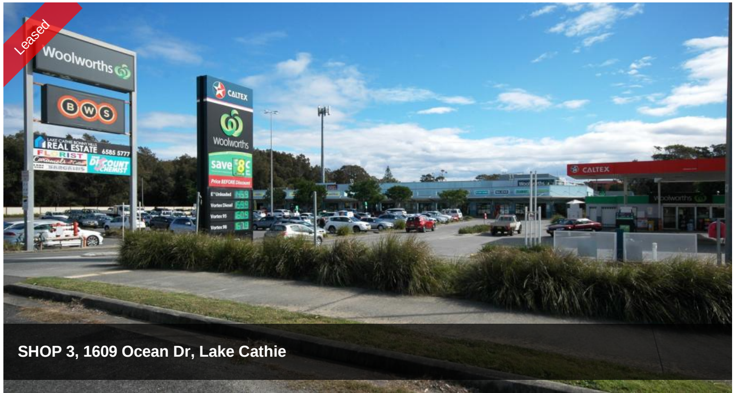
SHOP 3, 1609 Ocean Dr, Lake Cathie