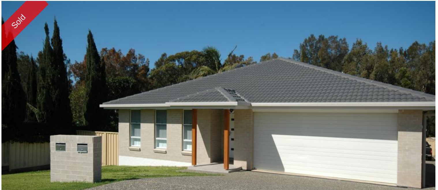
36A Bligh Place, Lake Cathie