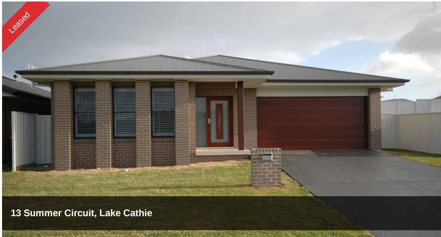
13 Summer Circuit, Lake Cathie