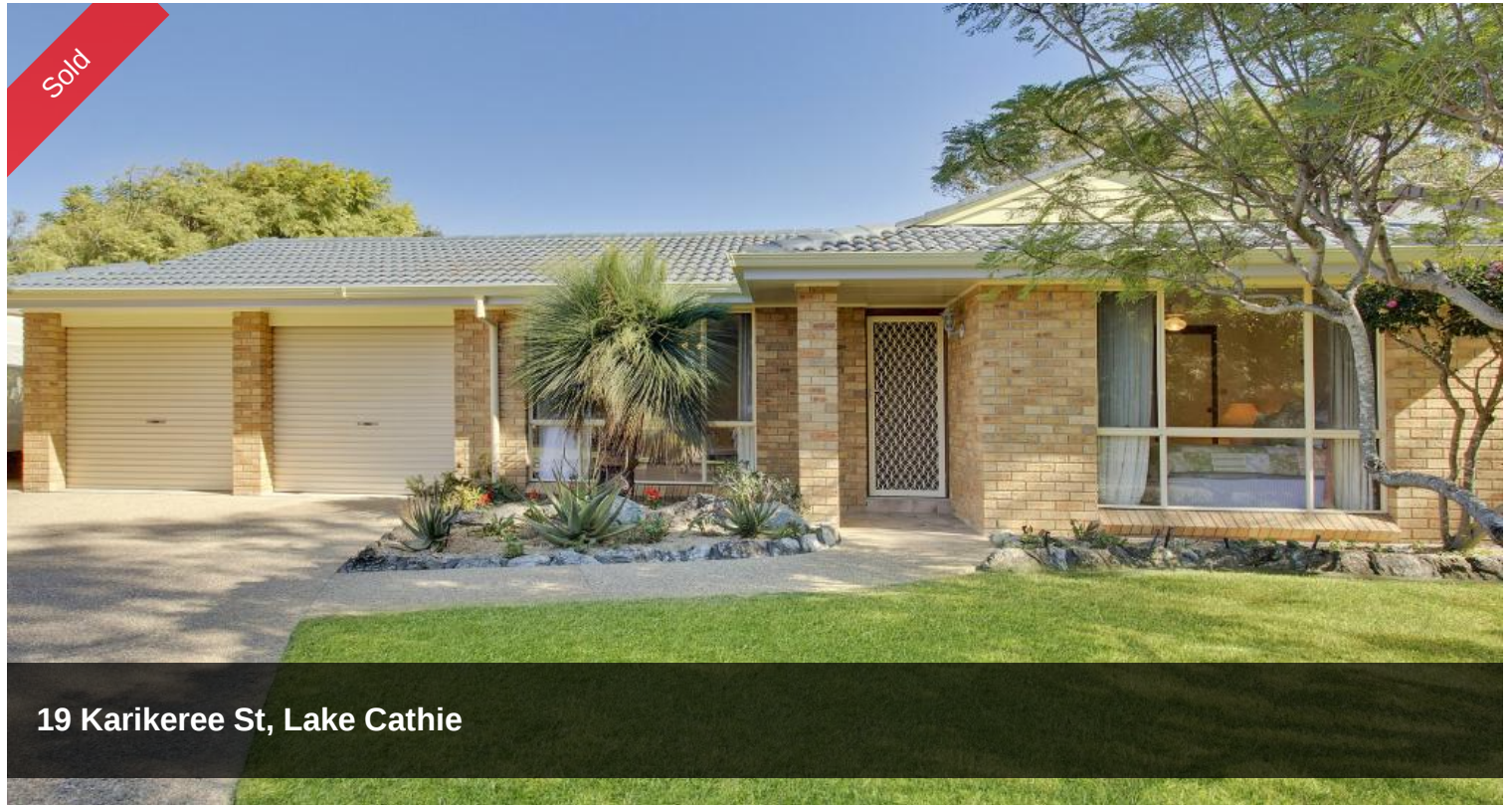
19 Karikeree St, Lake Cathie