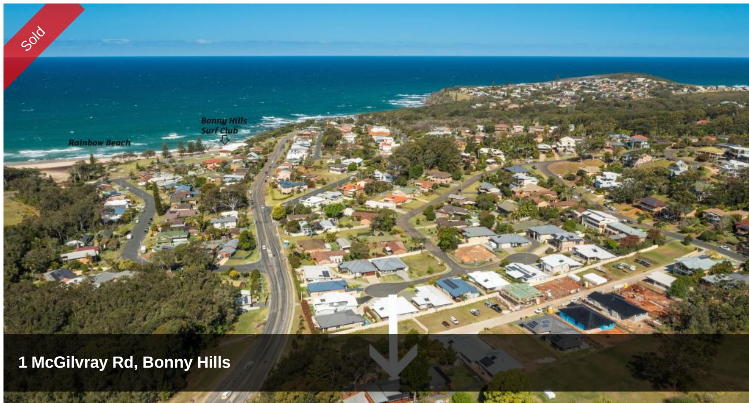
1 McGilvray Rd, Bonny Hills