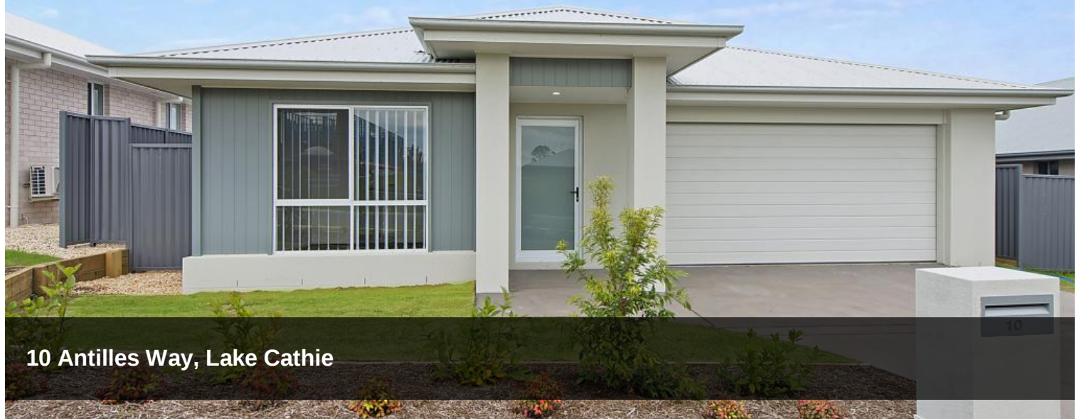
10 Antilles Way, Lake Cathie