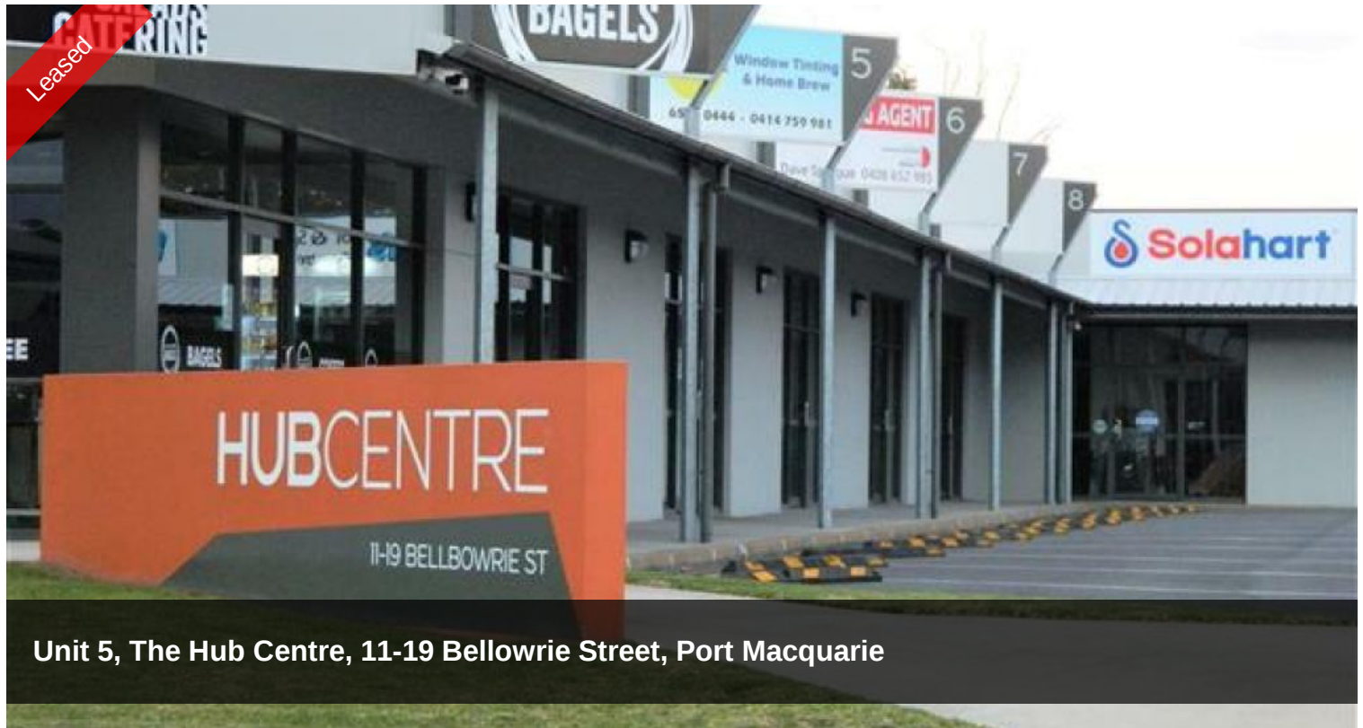
Unit 5, The Hub Centre, 11-19 Bellowrie Street, Port Macquarie