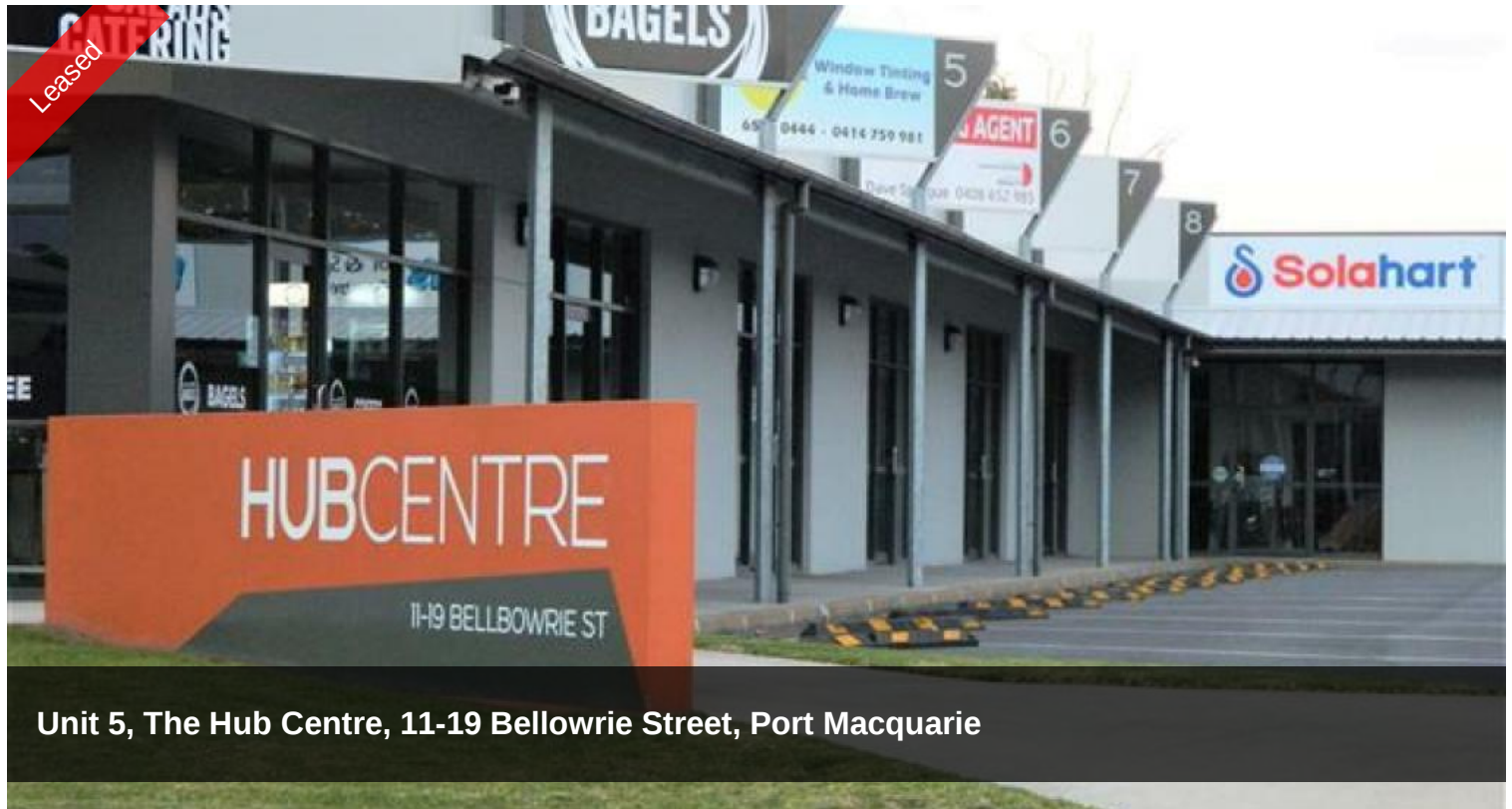
Unit 5, The Hub Centre, 11-19 Bellowrie Street, Port Macquarie