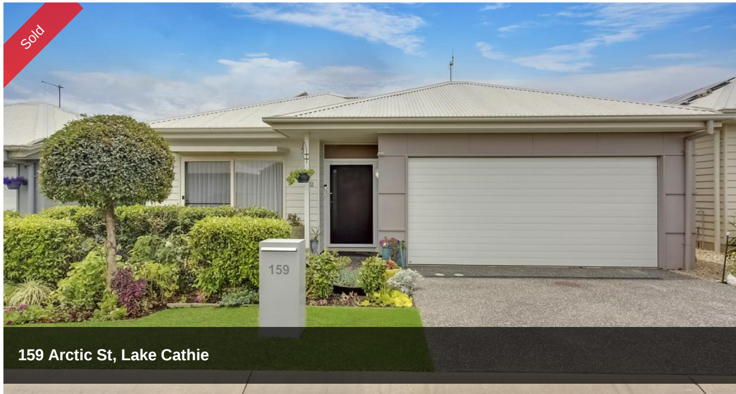
159 Arctic St, Lake Cathie