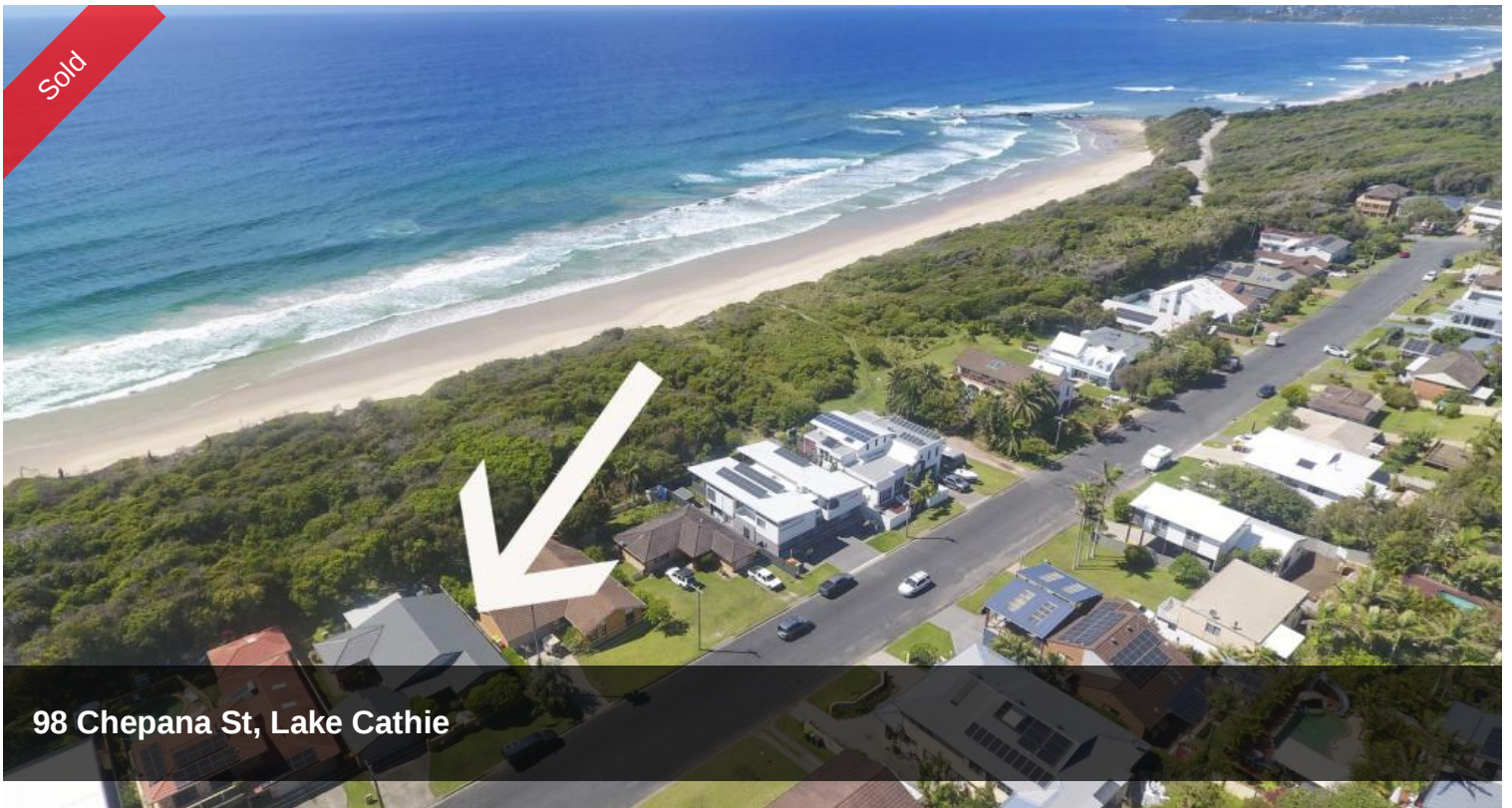
98 Chepana St, Lake Cathie