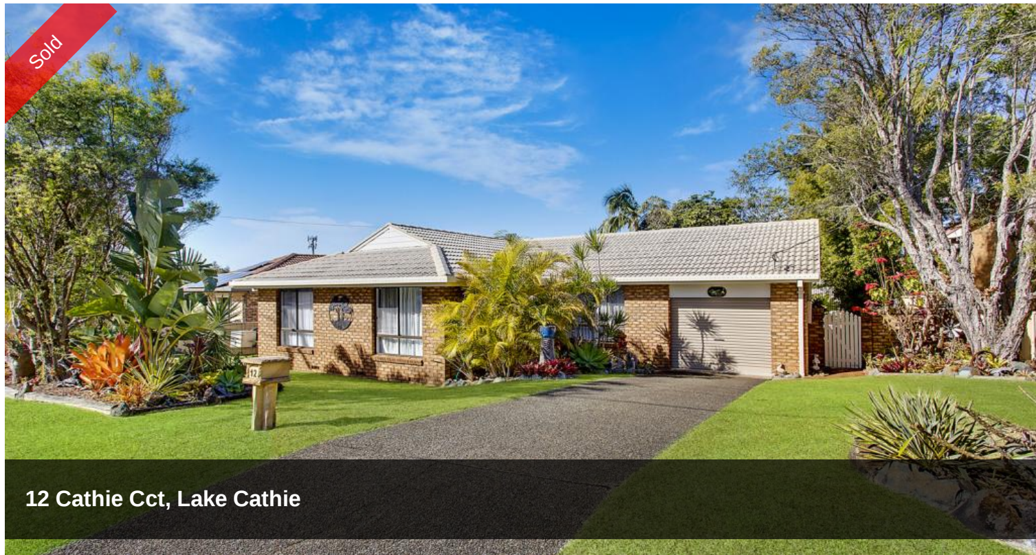
12 Cathie Cct, Lake Cathie