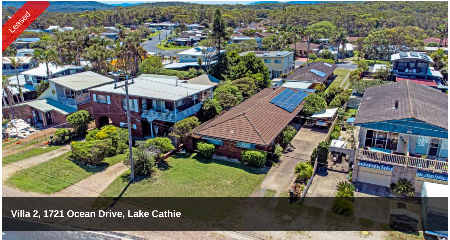
Villa 2, 1721 Ocean Drive, Lake Cathie