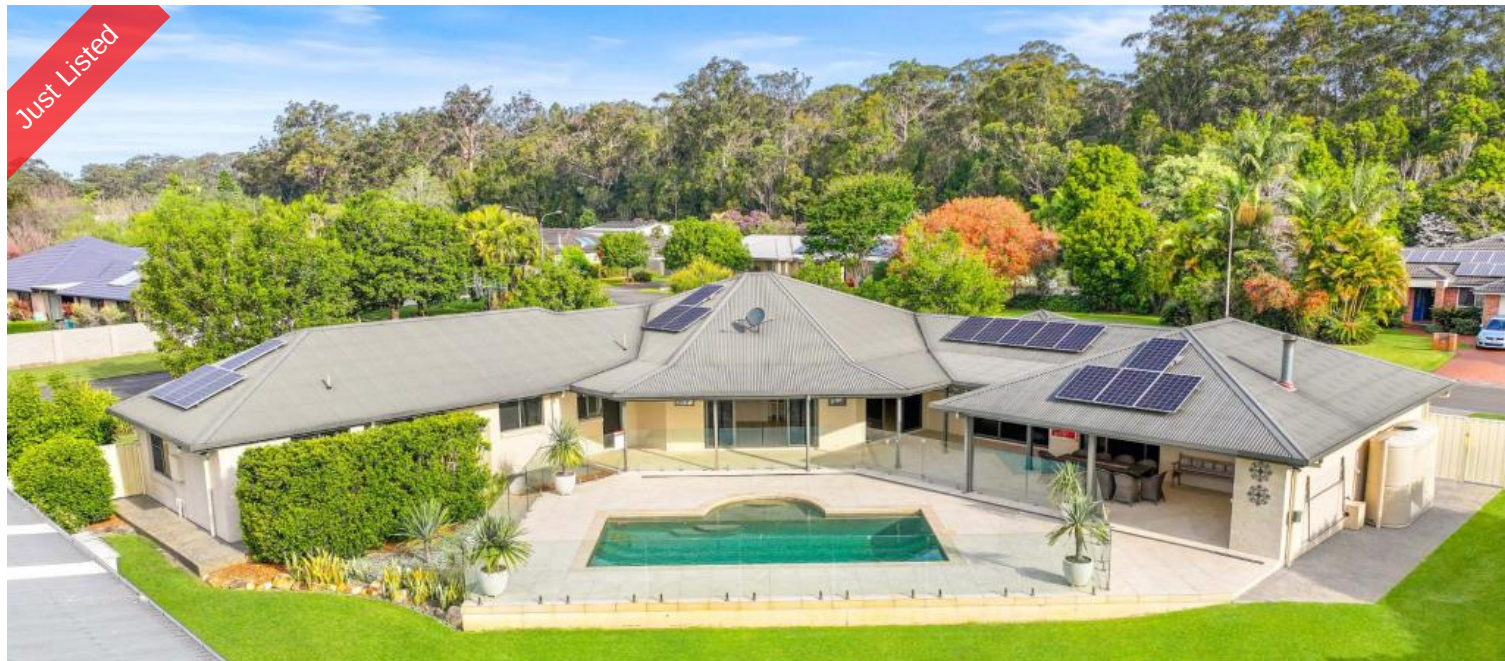
1 Shearwater Court, Lake Cathie