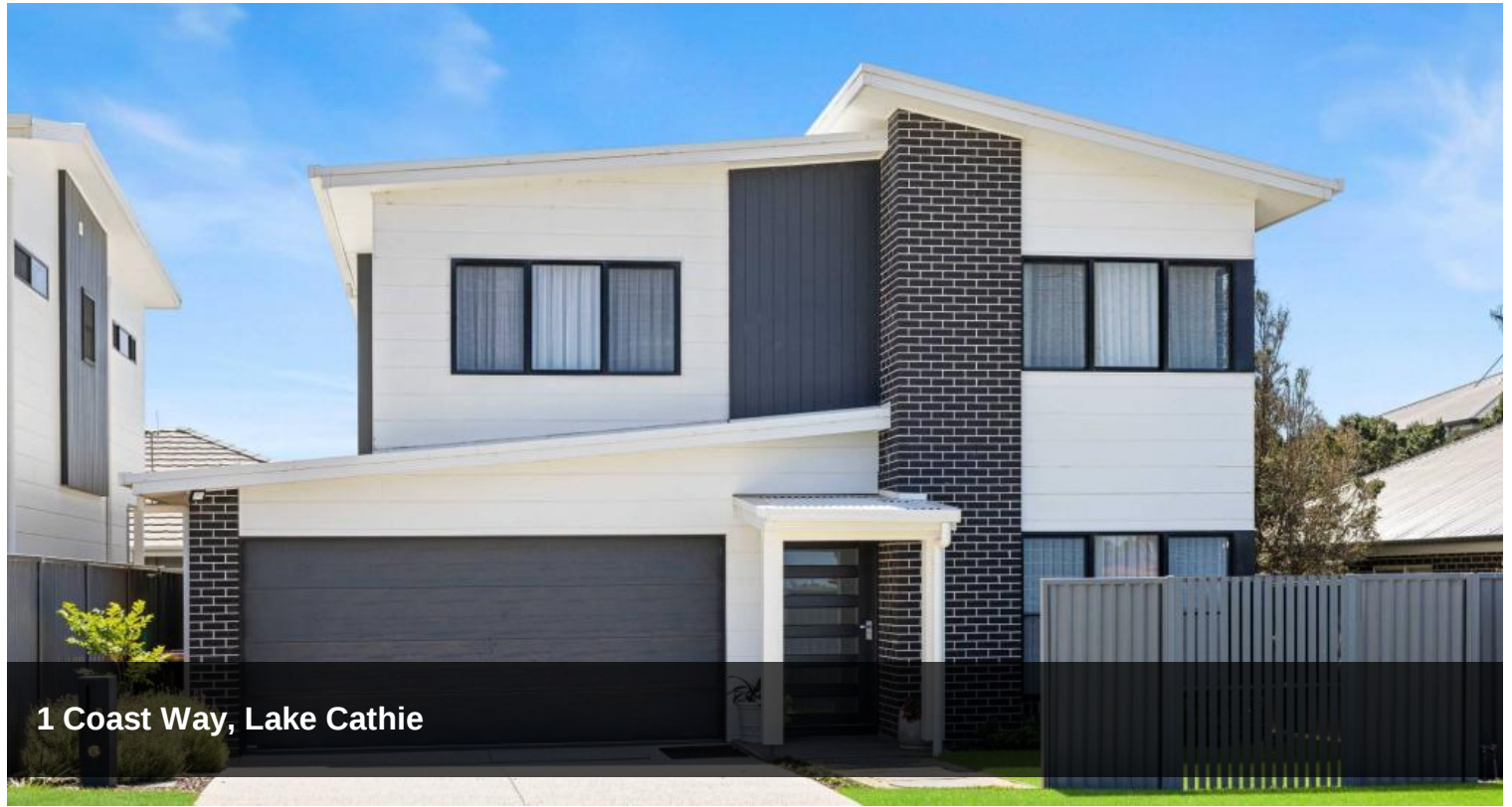
1 Coast Way, Lake Cathie