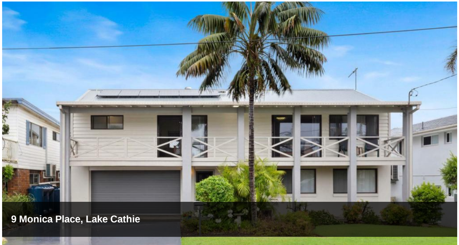
9 Monica Place, Lake Cathie