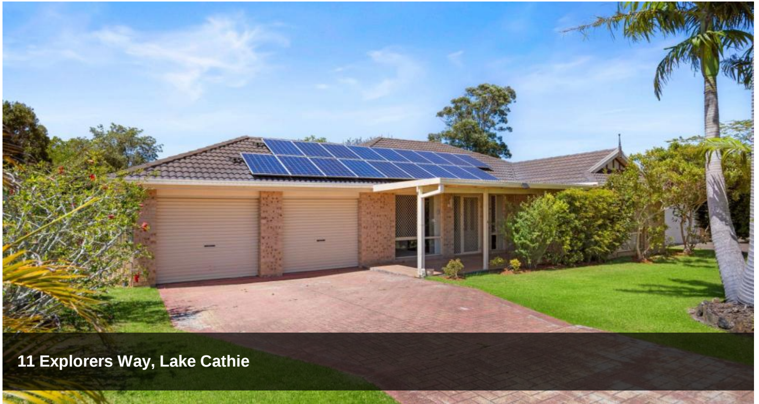
11 Explorers Way, Lake Cathie