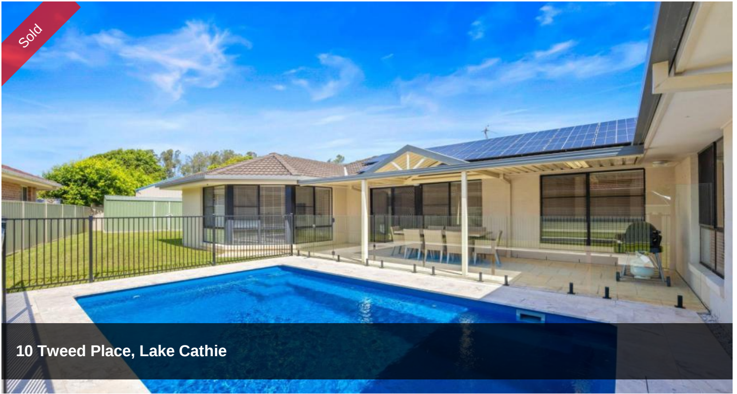
10 Tweed Place, Lake Cathie