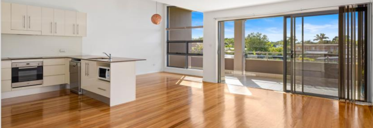
Unit 12, 63-65 The Parade, North Haven