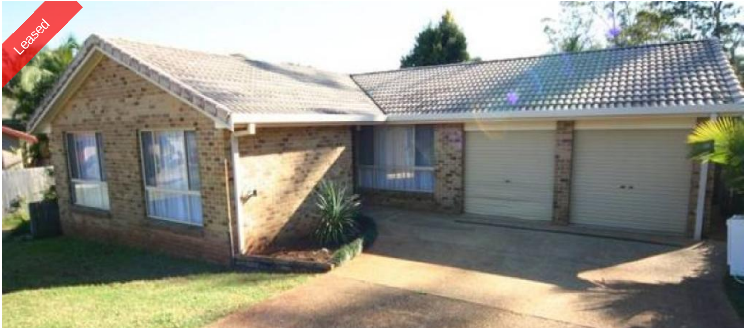
11 Magnolia Place, Port Macquarie