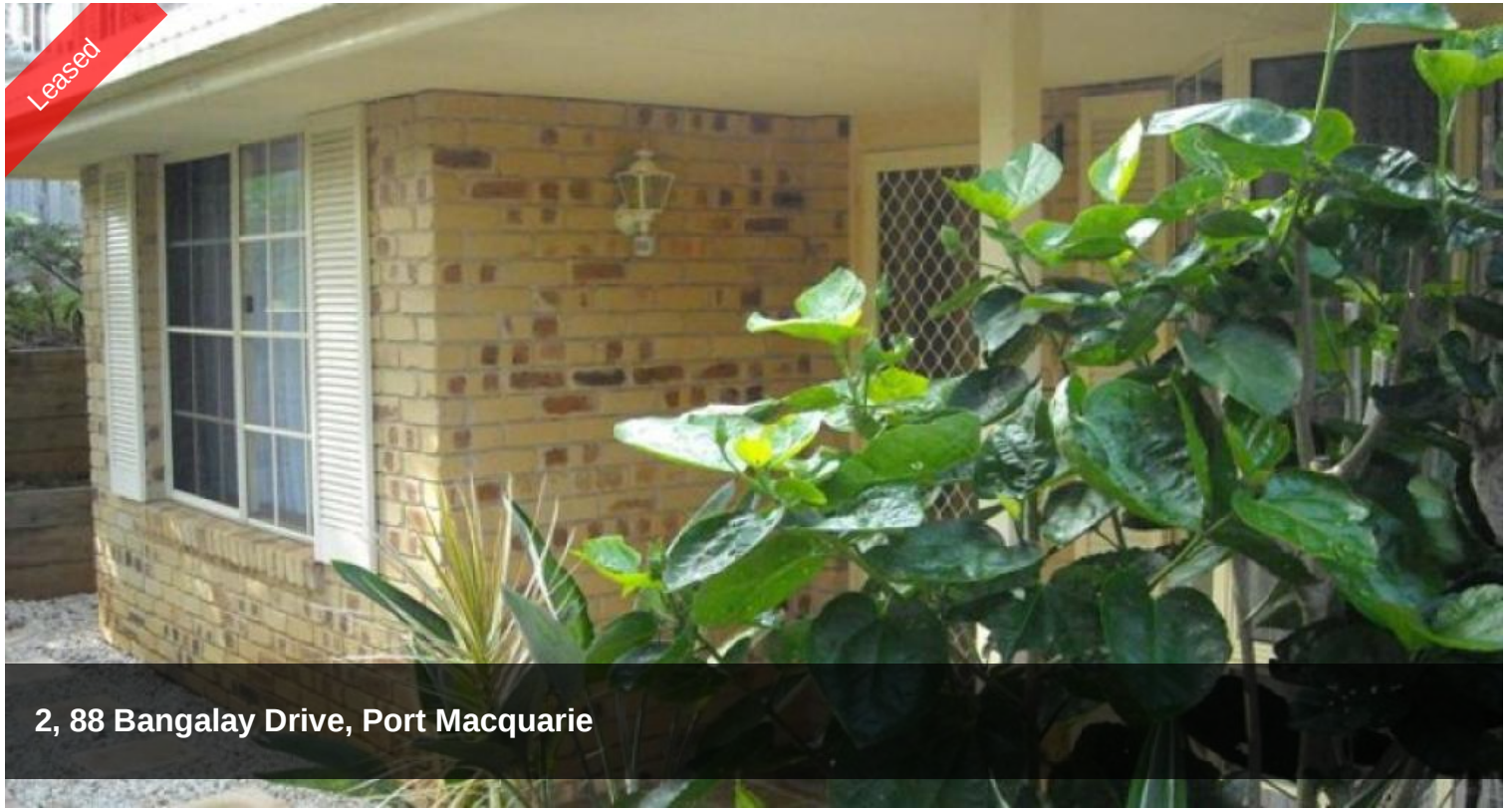
2, 88 Bangalay Drive, Port Macquarie