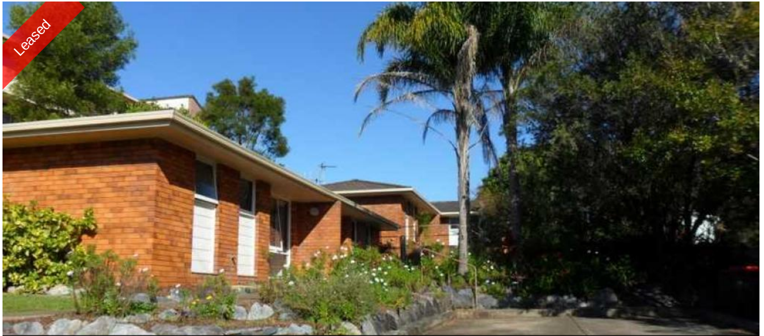
1, 23 Garden Crescent, Port Macquarie