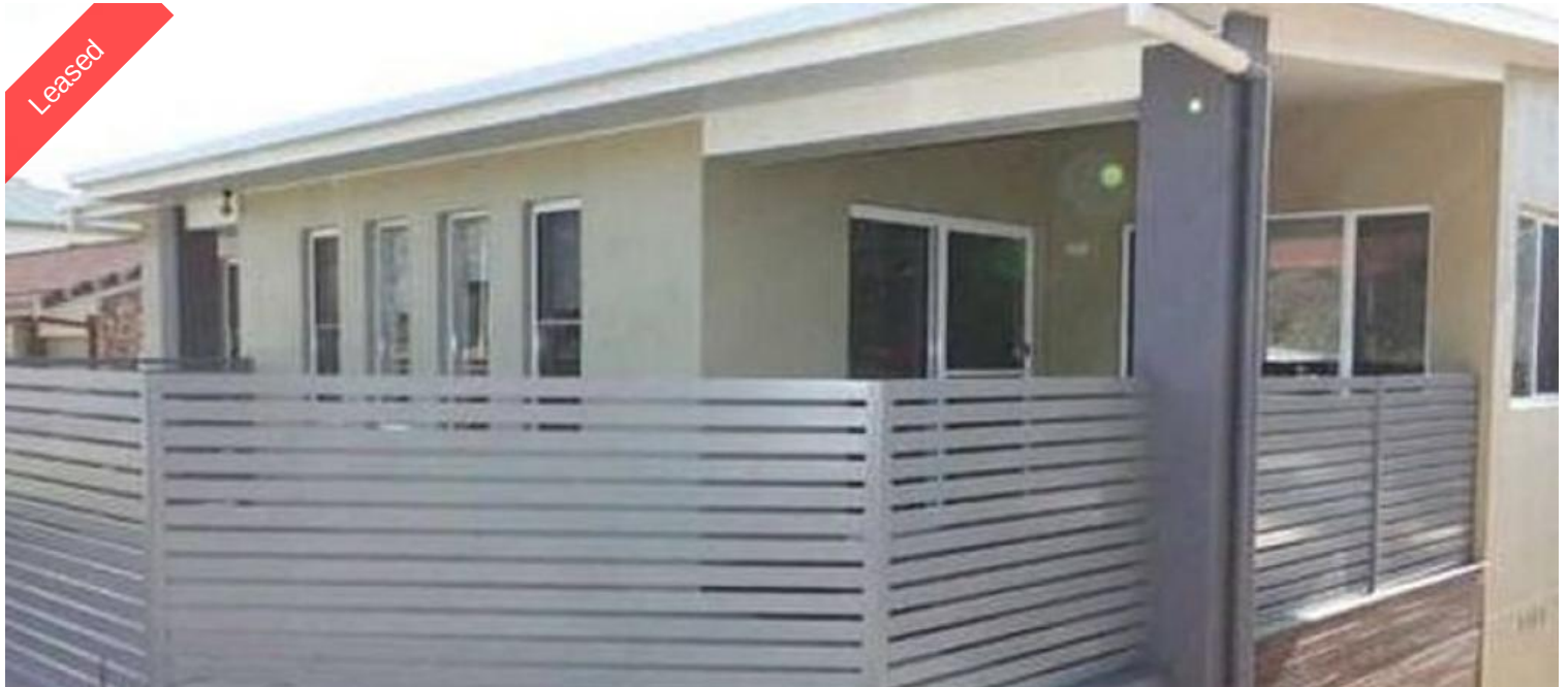
1, 23 Fiona Crescent, Lake Cathie