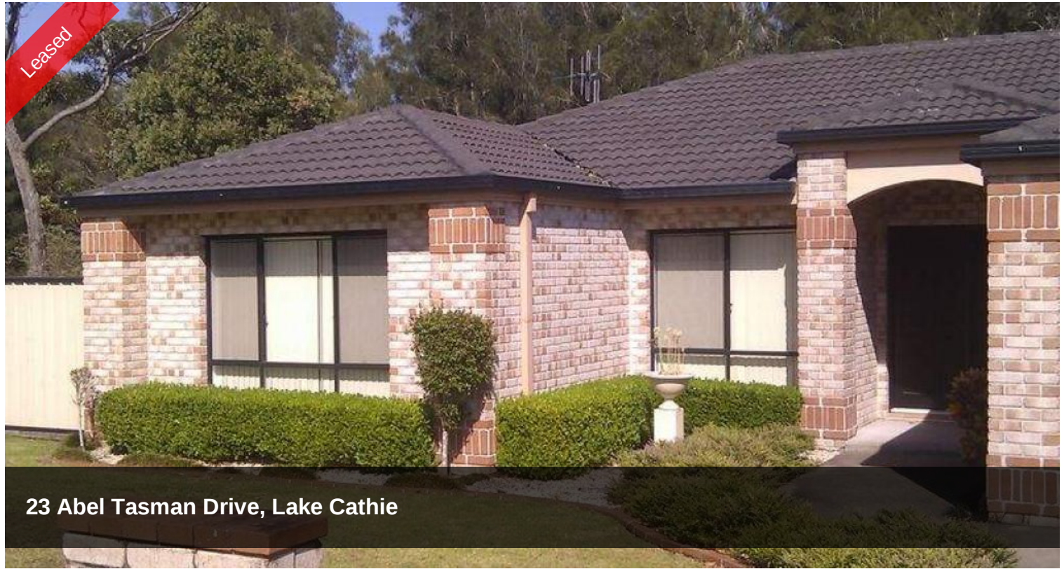
23 Abel Tasman Drive, Lake Cathie